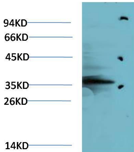
Western blot analysis of Mouse Brain Tissue Lysate using AMPK \gamma 1 Rabbit pAb diluted at 1:2000