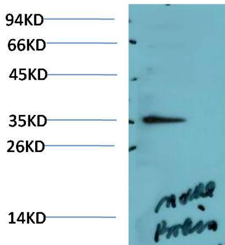
Western blot analysis of Mouse Brain Tissue Lysate using AMPK \gamma 1 Rabbit pAb diluted at 1:2000.